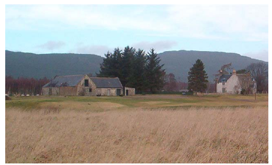
Fig.3. Site and steading viewed from the south east (vacant house not part of the site).