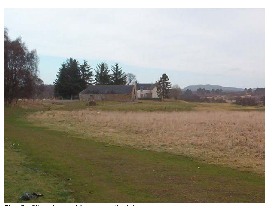
Fig. 2. Site viewed from south side

3. Including the recently expired temporary permission for the use of the steading for golf buggy storage, and prior to the 2007 application, the site has been the subject of previous