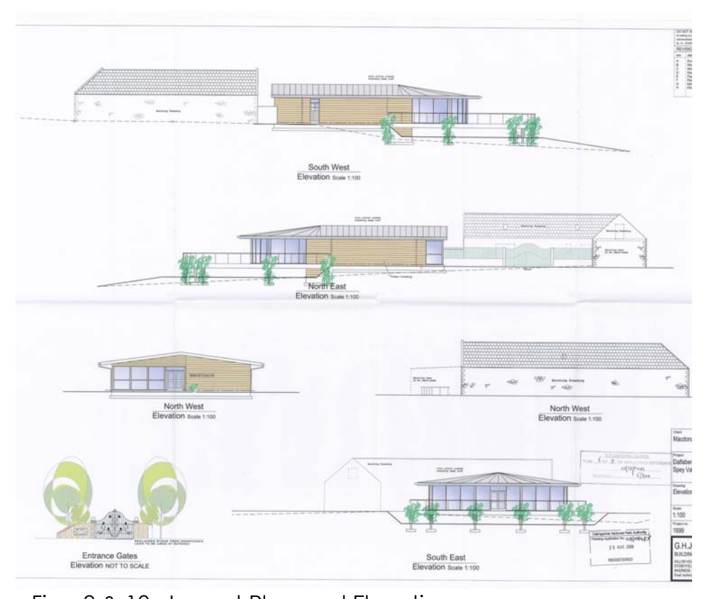
Figs. 9 & 10. Layout Plan and Elevations