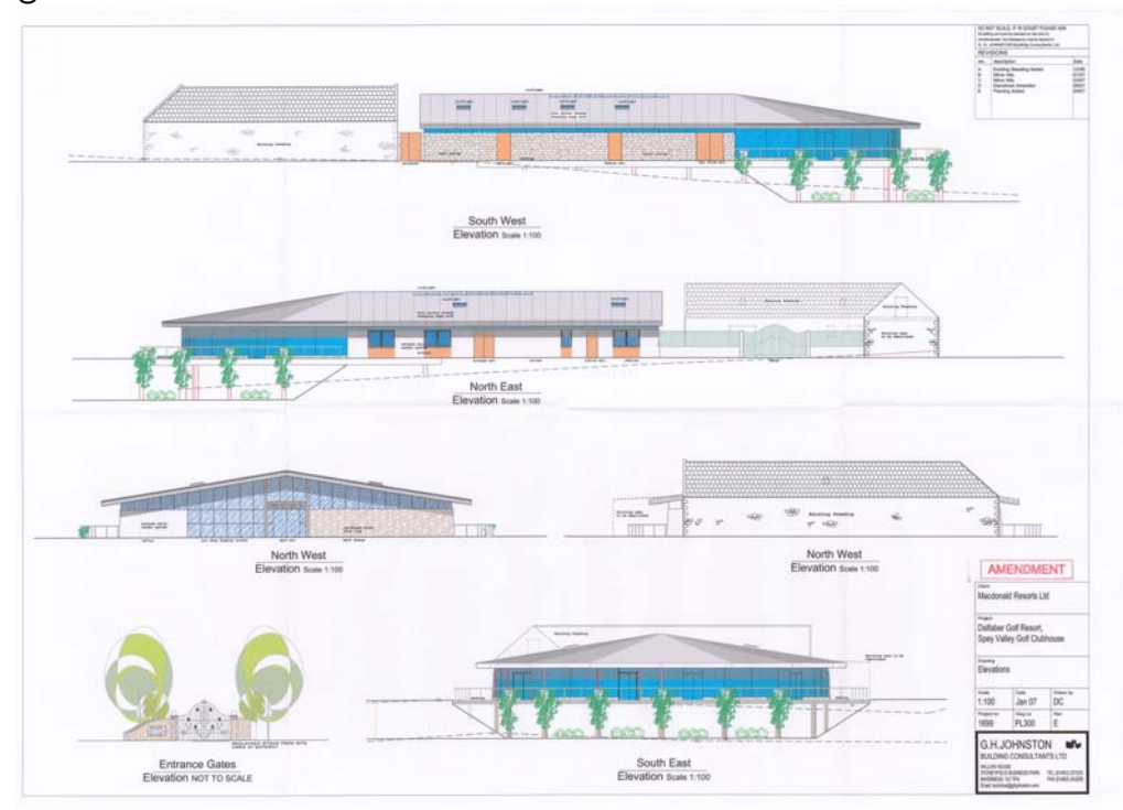
Fig. 5. Elevations – Previous Proposal

with outdoor decking, taking advantage of the elevated views over the golf course. Materials included zinc colour coated standing seam roof (with some rooflights), glazing, stone reclaimed from the site, white wet dash render, and some timber panels. The curved glazed frontage extended above the ground levels which slope down to the golf course and this area was supported by columns. Planting was indicated on the decking area. The juxtaposition of the two buildings created a courtyard area which was enclosed by a wall and railings with a gate.