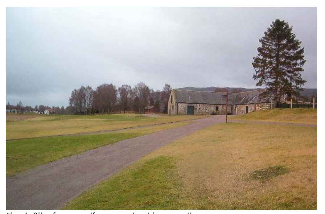
Fig.4. Site from golf course looking south Previous proposal

4. The previous approved proposal included a permanent change of use of the existing steading building for golf buggy storage purposes but also a new building immediately adjacent on the south east side. This accommodated a bar/restaurant with related stores and kitchen areas, a "pro" shop, office, and male and female changing, shower and toilet facilities. This new building took a single storey form with curved glazed frontage